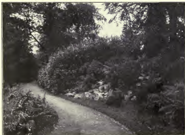
THE DEAN'S WALK AT GOSFORD CASTLE